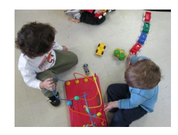
Our Center's Program

Our staff also sees family as partners in each child's development and encourages ongoing communication and input.